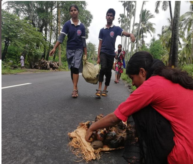
ONE TREE FOR ONE STUDENTS